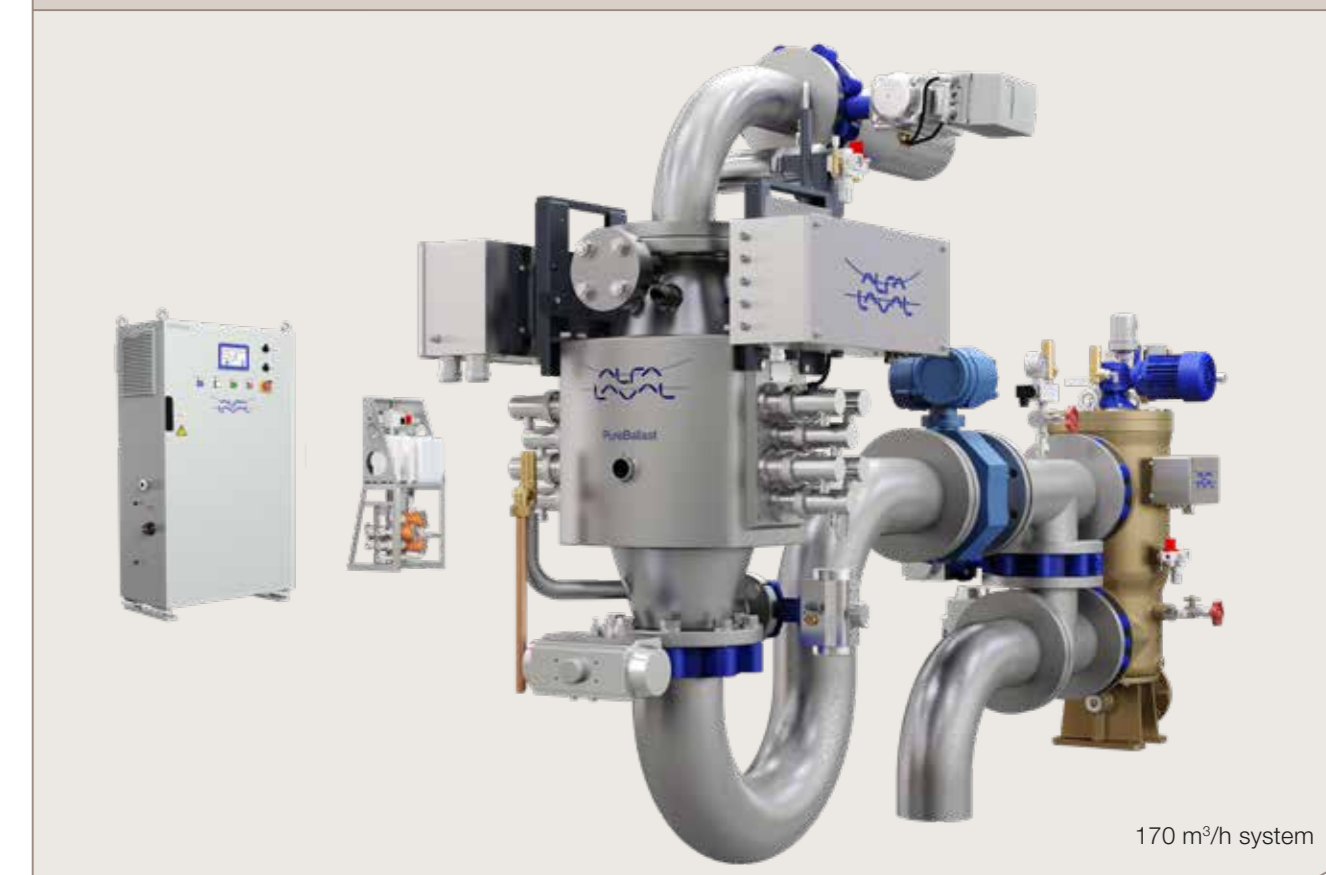
170 m 3 /h system

Now in its third generation, Alfa Laval PureBallast is an automated inline treatment system for the biological disinfection of ballast water. Operating without chemicals, it combines initial filtration with an enhanced form of UV treatment to remove organisms in accordance with stipulated limits.